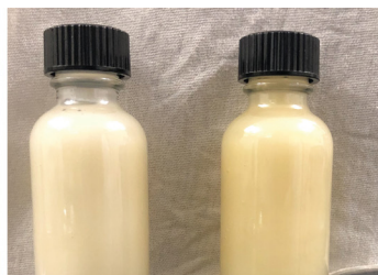
High oleic soap (left) vs. soybean oil