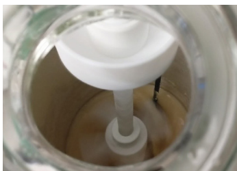
Running reaction in soap production